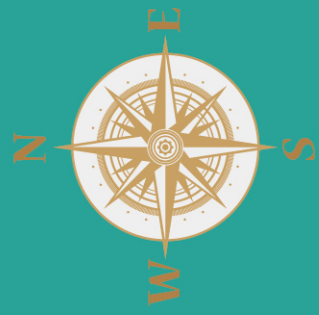
804 高雄市鼓山區蓮海路70號 / 804 No.70, Lien-hai Road, Gushan District, Kaohsiung, Taiwan